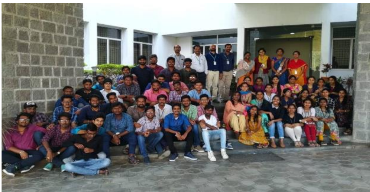
Dept. of ECE students and faculty INCOIS visit 2018-2019