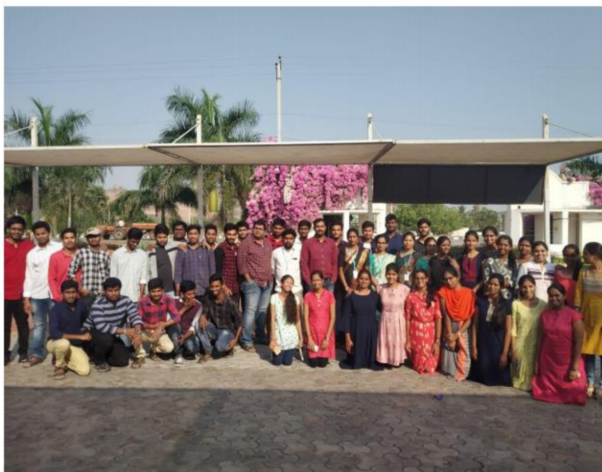
Dept. of ECE students and faculty RTTC visit 2018-2019