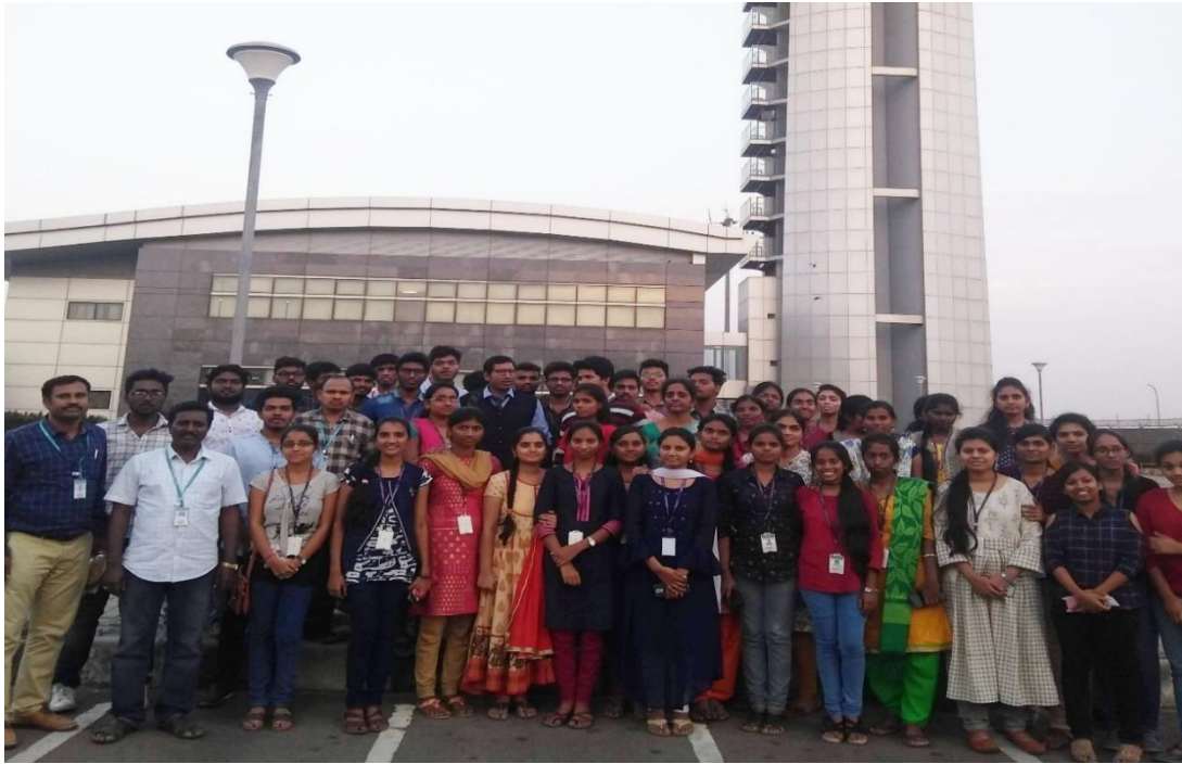
Dept. of ECE students and faculty AAI-RADAR (Shamshabad Airport) visit 2018-2019