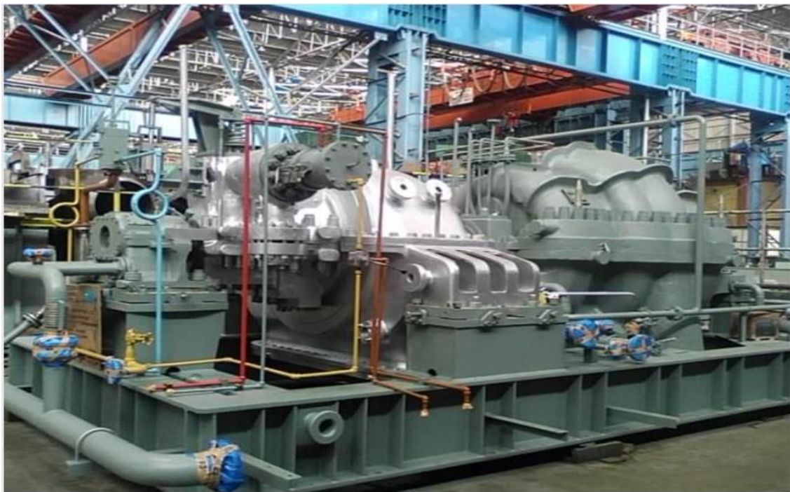
Most powerful compressors for offshore applications (over 30,000 HP) and re-injection compressors with delivery pressures as high as 10,000 psi (700 bar)