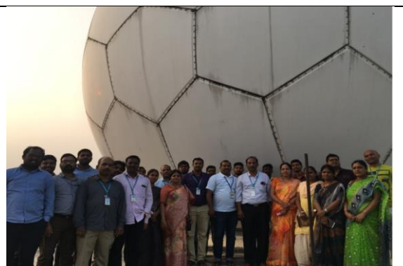
Dept. of ECE faculty IMD visit 2019-2020