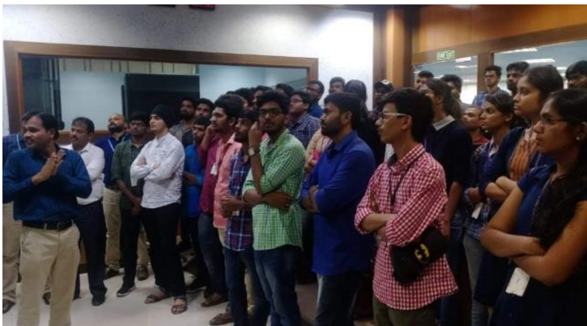
OCEAN STATE FORECAST(OSF)