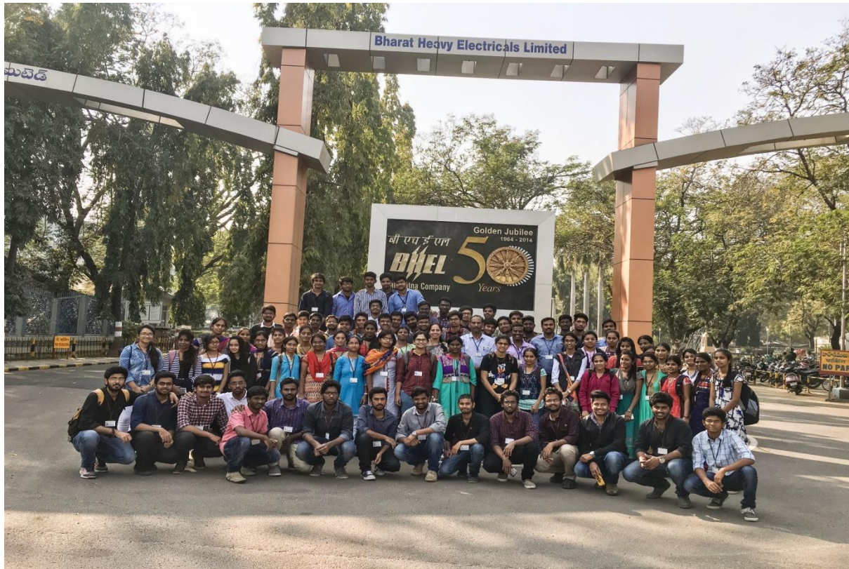
Dept. of ECE students and faculty BHEL visit 2017-2018