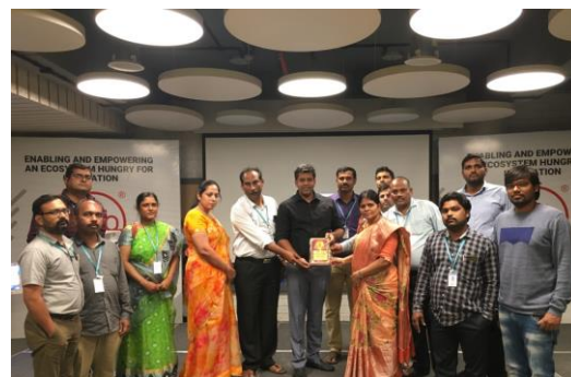
Dept. of ECE faculty T-Hub visit 2019-2020